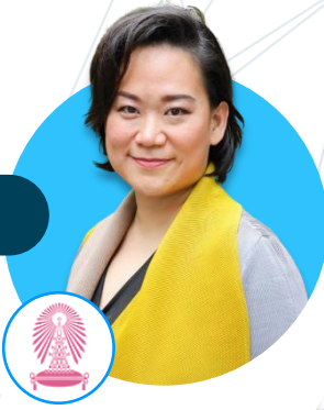
VP Strategic Planning, Innovation & Global Engagement