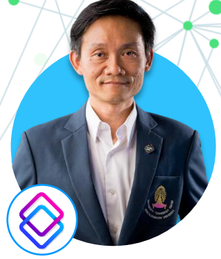
Founder, Chulalongkorn University Technology Center